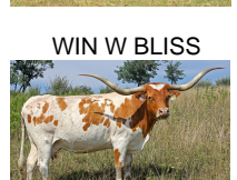
WIN W BLISS